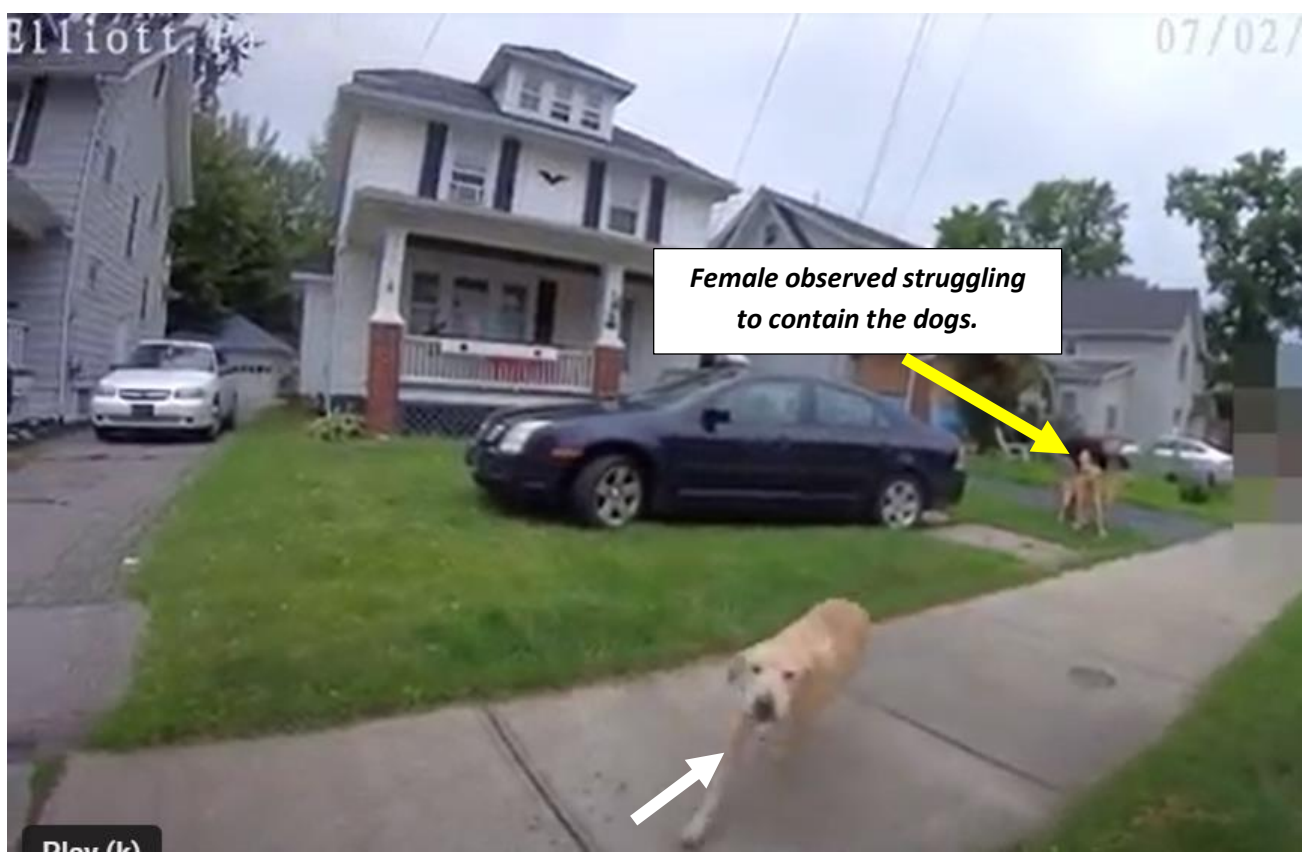
The dog at the bottom of the photograph is NOT the animal who ended up charging Officer Palmer. The dog that charged Officer Palmer is seen in the photograph with the female.