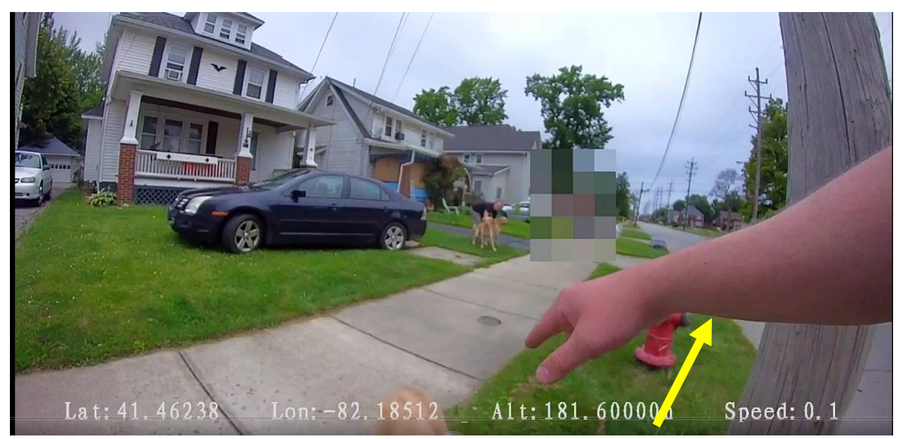
Officer Palmer giving commands to control the dog.