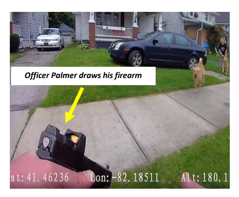
Time elapsed = less than one second